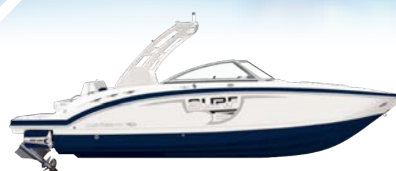
244 SUNESTA SURF