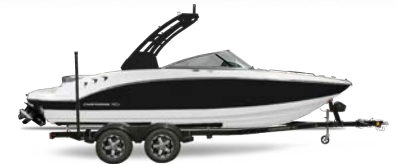
23 H2O SPORT