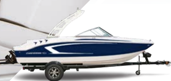
19 H2O SPORT