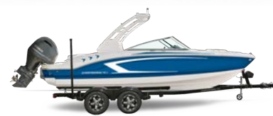
21 H2O SPORT OB