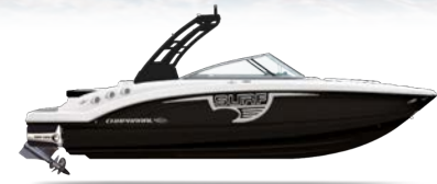
246 SSI SURF