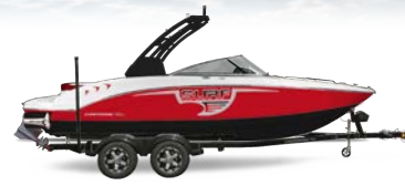
23 H2O SURF