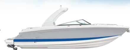
297 SSX SURF