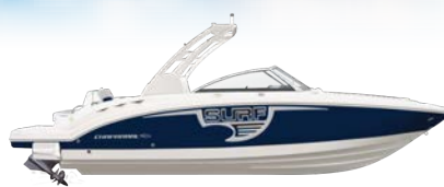
264 SUNESTA SURF