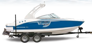
21 H2O SURF