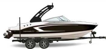
21 H2O SPORT